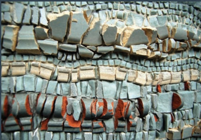
Jo Braun, Great Silence (detail), 2011, 29 x 38½ x 2 in