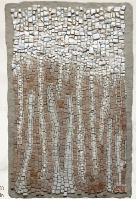
Jo Braun, Gypsum Board , 2008 20 x 30 x 1¼ in